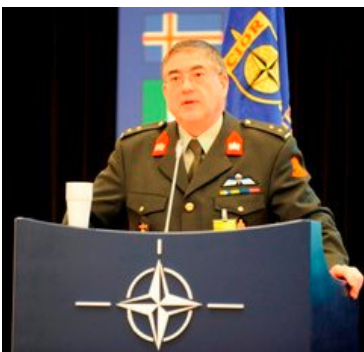
Lieutenant Colonel Willem Verheijen (Royal Netherlands Army)

On behalf of CIOR, the Inter-Allied Confederation of Reserve Officers, I invite you to attend a one - day symposium in Stavanger Norway on 11 August 2010, where you will gather with reservists, officers, politicians, government officials and NGO representatives from over 30 NATO and Partnership for Peace countries. There, you will participate in a dynamic exchange of knowledge, ideas and perspectives about NATO’s Comprehensive Approach, an emerging, evolving and sometimes controversial doctrine that will shape the future of joint operations in the new era of asymmetric warfare. The symposium will place special emphasis on the current and future roles that reservists might play within this doctrine, given the civilian -military aspect of “Comprehensive Approach”.